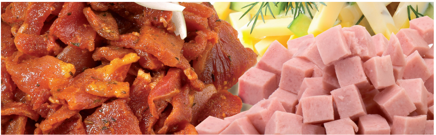
Meat, sausage, bacon, and ham can be diced just as easily as vegetables, cheese, fruit or fish.